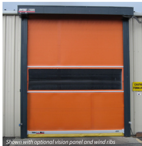
Shown with optional vision panel and wind ribs