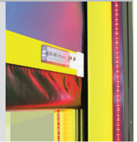
Pathwatch warning lights, Turbo-Seal Insulated pictured