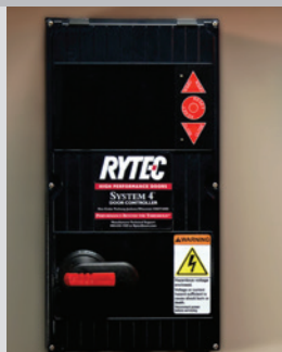
System 4 shown with optional rotary disconnect