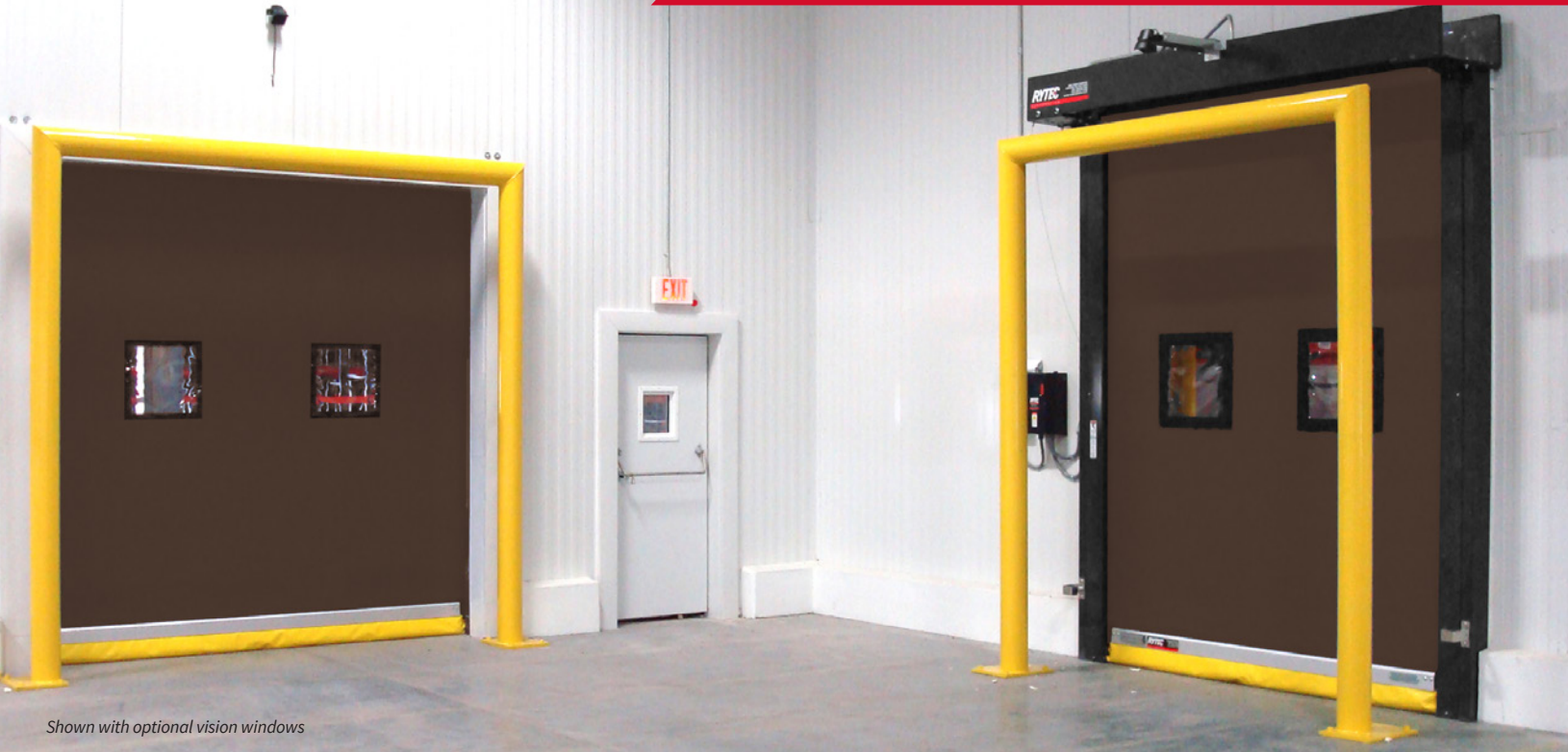
Shown with optional vision windows