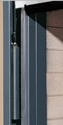
Counterweights within side column