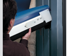
Break-Away tabs reinsert into side columns