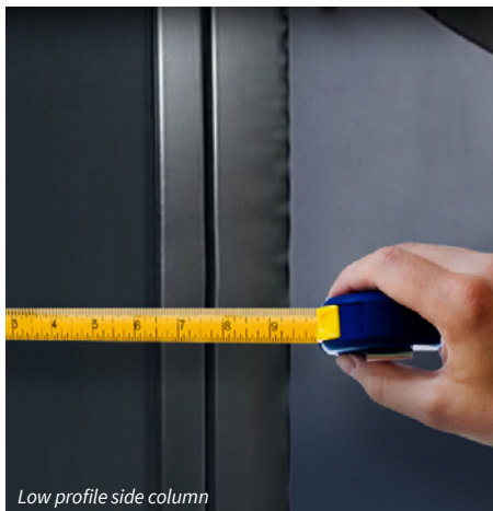
Low profile side column

Where traffic patterns near the doorway are tight and speed is critical, the Turbo-Seal ultra high-speed door is your best solution. Such situations tend to create greater potential for doors to get hit because of the relatively short approach to the door. The extra speed and low profile offered by the Turbo-Seal minimizes that potential by getting the door out of the way faster and requiring a smaller footprint.