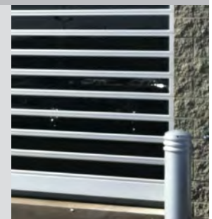
Grey tinted slats shown