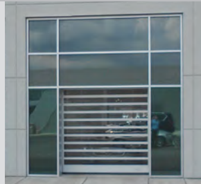
Nine-inch high vision slats for increased visibility