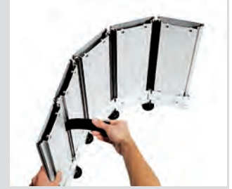
Integral rubber weatherseal