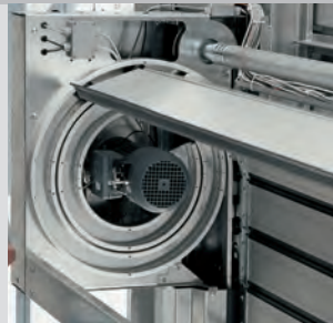
AC drive motor