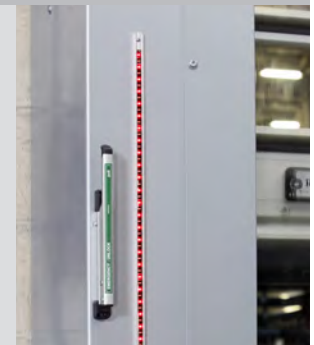
Pathwatch warning lights and brake release lever shown