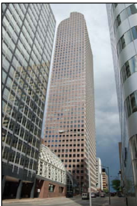
Wells Fargo Center