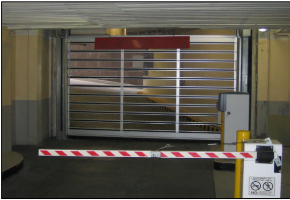
Transamerica Pyramid San Francisco, CA The Rytec Spiral® Rolling Grill Door provides high security and air flow at the tallest and most recognizable skyscraper in the San Francisco skyline.

Transamerica Pyramid, San Francisco, CA TransCanada Tower, Calgary, CANADA Travelers, Hartford, CT Travelers, St. Paul, MN University of California - San Diego, San Diego, CA University Southern California, Los Angeles, CA Urban Neighborhoods, Denver, CO Vallagio at Inverness, Denver, CO Williams Center, Tulsa, OK World Financial Center, New York, NY