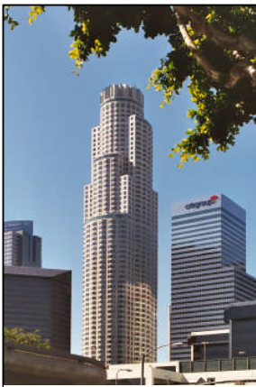
US Bank Tower

Enhance Architectural Style: Rytec's Spiral FV offers high speed and a high tech look—which can compliment contemporary interior designs. It is especially suited for commercial applications where high visibility and light transmission are important.