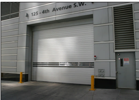
TransCanada Tower Calgary, AB The Rytec Spiral® Door provides street-level security at every access point in this office tower located in Calgary.