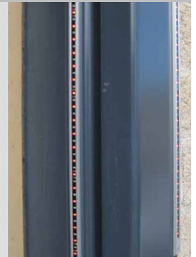
Pathwatch warning lights