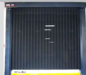
Full screen panel shown

Standard maximum sizes shown; larger sizes may be available upon request.