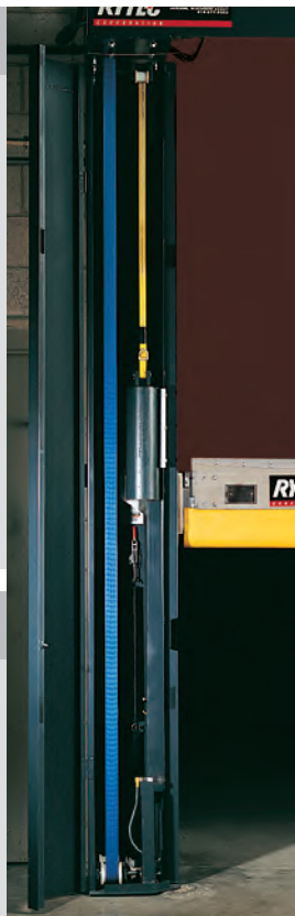
Side column with patented System II ®