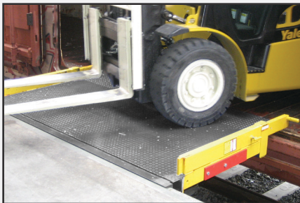
Standard yellow run-off guards to help prevent a forklift truck from driving off the edge.