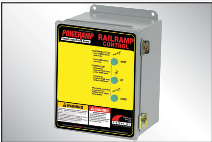
Constant pressure up, down and lip buttons provide continuous control to the operator.