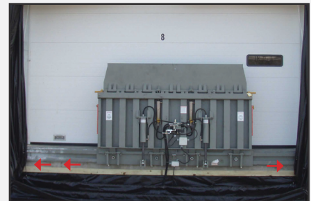
Roller trolley assembly allows for lateral movement to accommodate the position of the rail car.