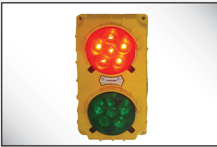
Exterior Lights - LED for longer life.