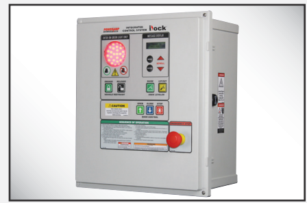
Upgrade to iDock Controls with optional integrated equipment for a more efficient loading dock.

The iDock™ Alert Communication System is an enhanced version of Poweramp's simple Dock Alert and provides a reliable warning system that establishes a clear line of communication between truck drivers and dock personnel, thereby reducing the risk of accidents at the loading dock.