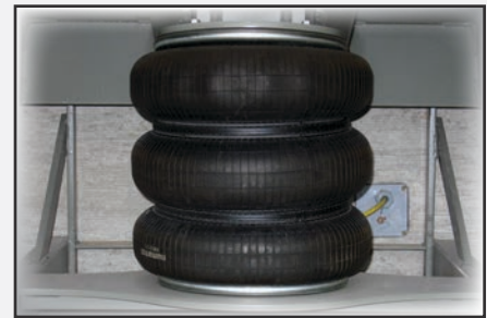
Steel belted rubber bellows system uses compressed air to raise platform.