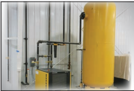
Simply connect the CA to existing plant air or a centralized compressor.