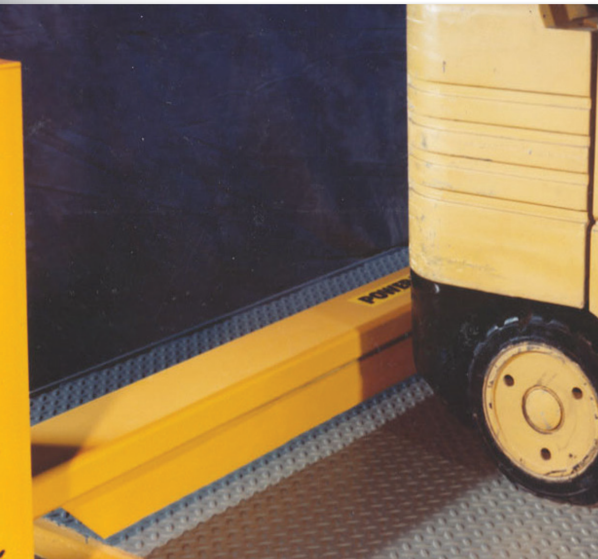
Barrier Lip shown on PR leveler with optional rubber weather seal. Standard controls shown.