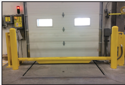
Collision protection for the overhead door.