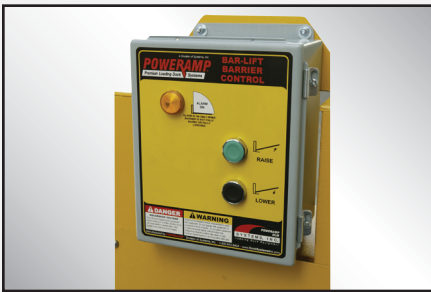
Interlock capable to door, leveler, restraint and other powered item at the dock.