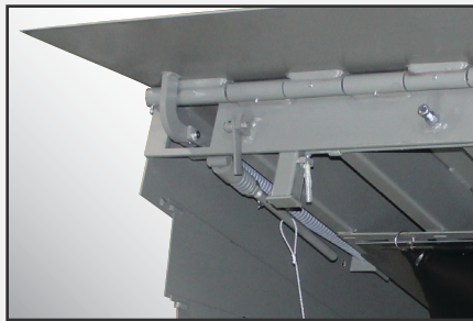
Unique lip latching mechanism provides positive, full height lip extension.