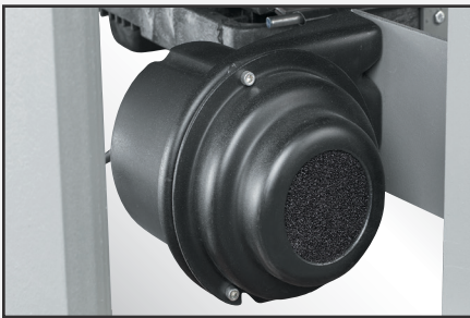
High volume, low pressure air blower to efficiently raise the leveler.