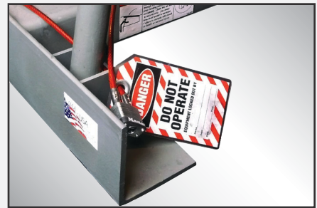
Lockout/tagout maintenance strut and lip supporting service strut.